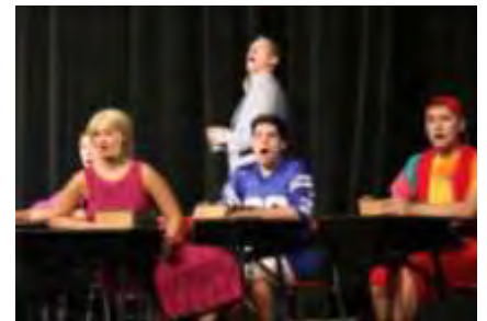
Miss Nelson is Missing