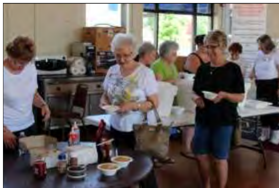
Boosters Ice Cream Social