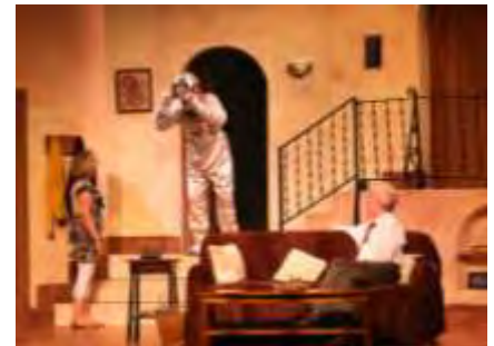
Alone Together Again