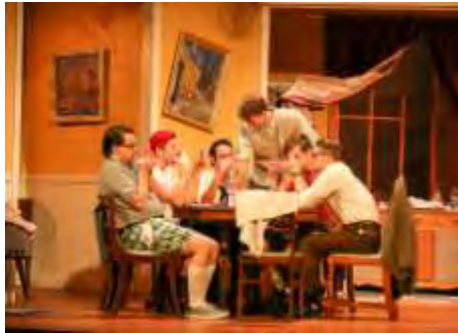
The Odd Couple