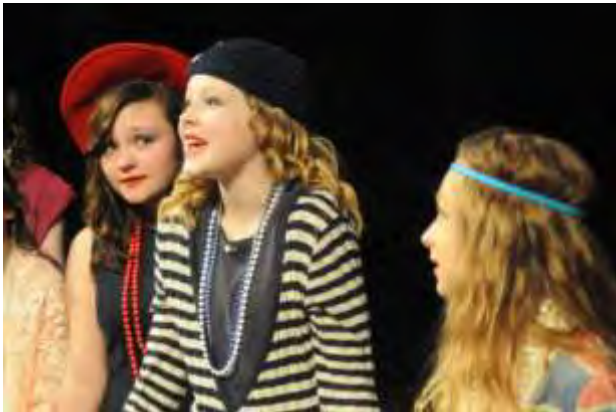
From the production of Charleston, 2015

Touching youth with quality arts experiences and supporting and supplementing the arts education offered by the schools is the entire focus of Tibbits Young Audiences.